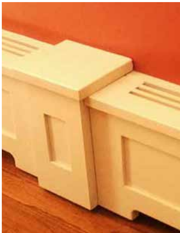
Joiner Cap for Paneled Heater Cover

All heater covers have an end cap for each end, and depending on the length and the layout of the walls the heater cover may have corner caps and one or more joiner caps.