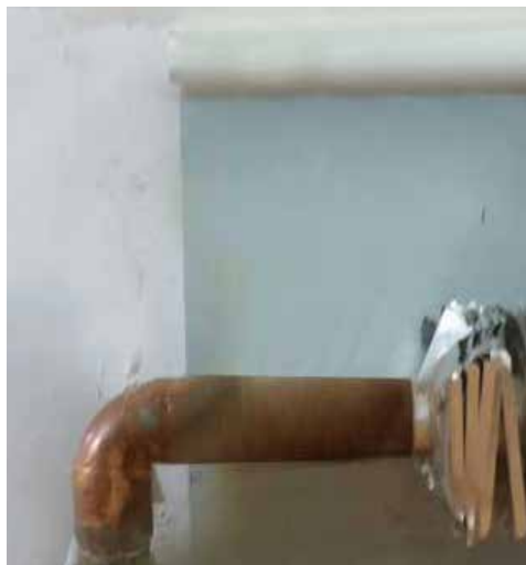
Leave only the Backplate

It is best to prepare to install your new wood baseboard heater cover by removing the end caps and the front panel from your existing metal cover. These parts will pull off easily.