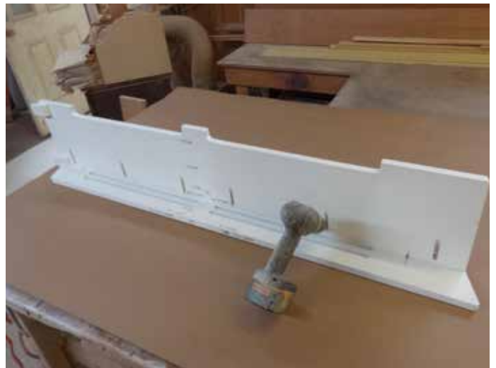
Screw the Frame & Panel together