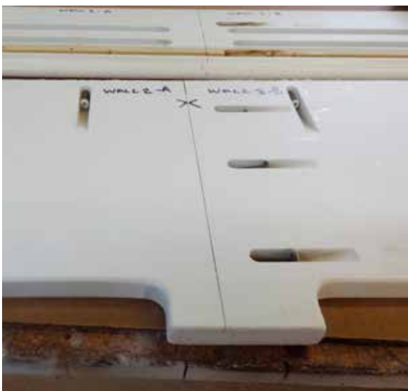
Push 2 Pieces Together

Assemble any remaining segments of top frames or front panels into their full sections the same way.