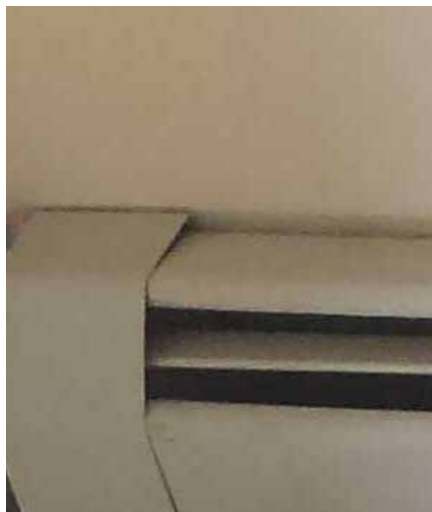
Typical Metal Baseboard Heater Cover