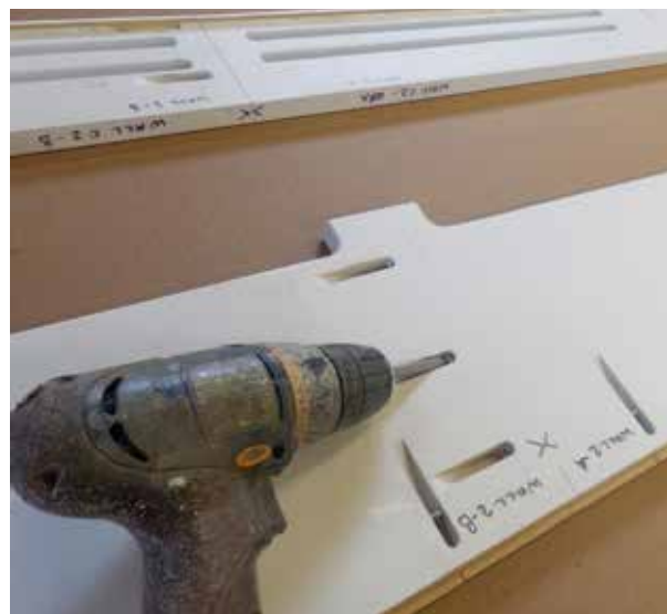
Secure 2 Pieces with Screws