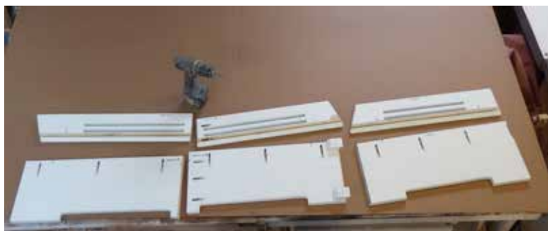
Long Heater Covers will have multiple segments.

Lay out the parts for your heater cover in front of the wall where they will be installed. A cover may be a short, straight heater cover in a hall or bath, or it may have several long sections wrapping around corners.