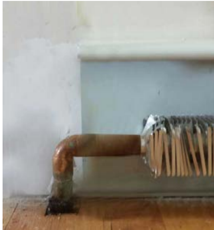
Leave only the Backplate

It is best to prepare to install your new wood baseboard heater cover by removing the end caps and the front panel from your existing metal cover. These parts will pull off easily.