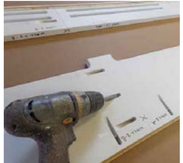
Secure 2 Pieces with Screws

When multiple pieces or segments are to be joined into a long section of heater cover, both the top frame and the front panel segments are made with an interlocking pattern to make lining up the parts easy. Simply push the 2 pieces firmly together, and tighten the 1-1/2" screws gently. Assemble any remaining segments of top frames or front panels into their full sections the same way.