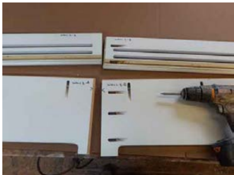
Layout parts according to their Labels

In any case take care not to over-tighten the screws, just make them snug.