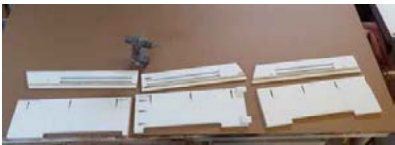
Long Heater Covers will have multiple segments.

Lay out the parts for your heater cover in front of the wall where they will be installed. A cover may be a short, straight heater cover in a hall or bath, or it may have several long sections wrapping around a corner.