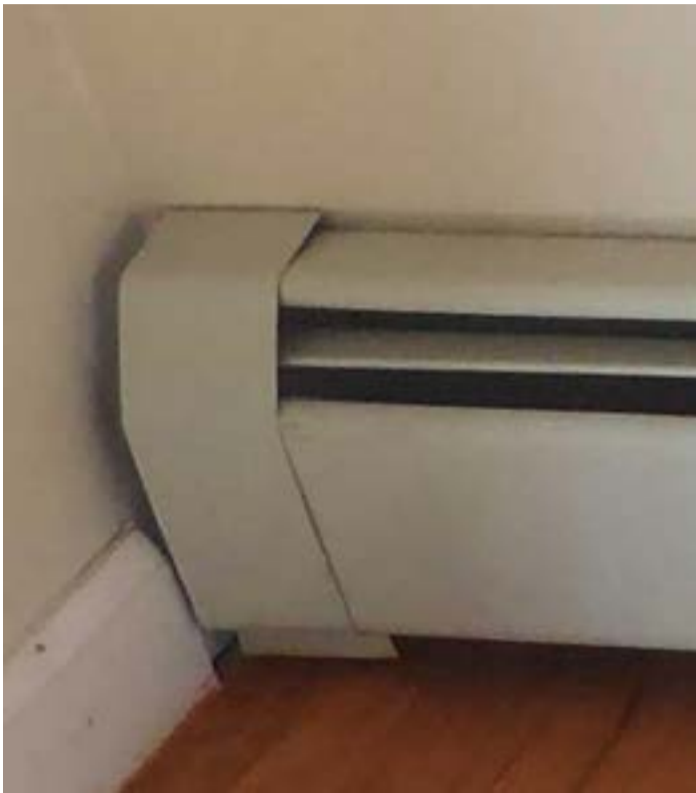
Typical Metal Baseboard Heater Cover