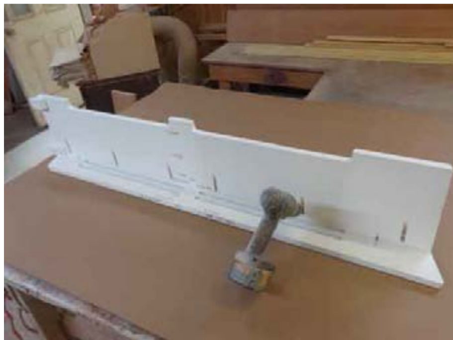
Screw the Frame & Panel together