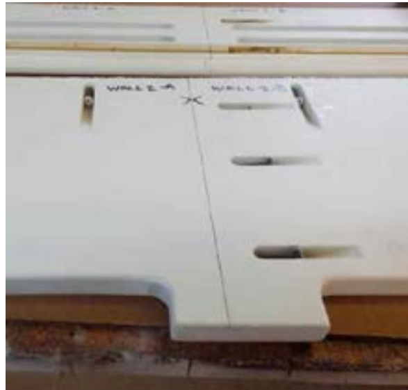
Push 2 Pieces Together