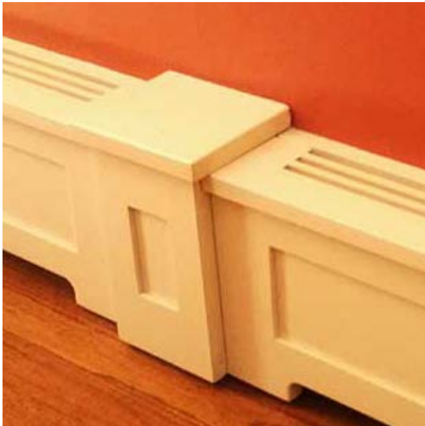
Joiner Cap for Paneled Heater Cover

All heater covers have an end cap for each end, and depending on the length and the layout of the walls the heater cover may have corner caps and one or more joiner caps.