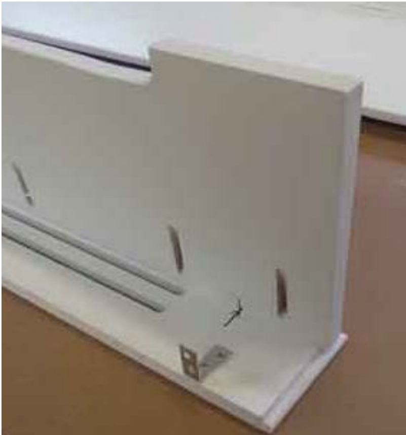
Screw Mounting Clips to Top Frame

Screw "L" Bracket mounting clips onto both ends of all top frames.