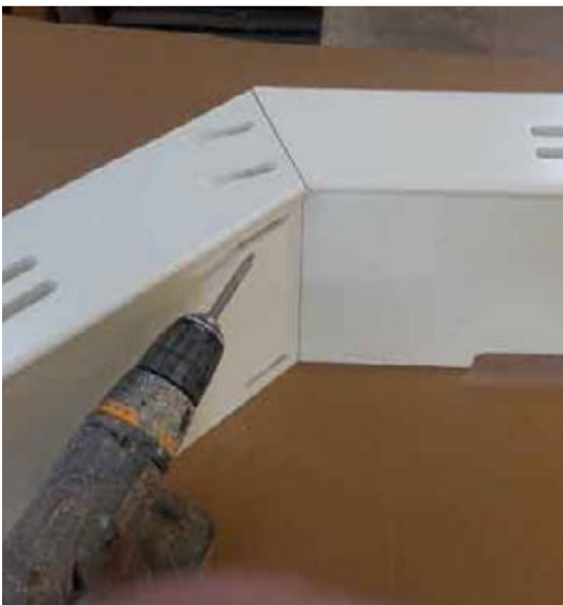
Screw the Corners Together

Slide each section into place on its appropriate wall.